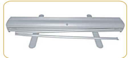
Storage of the bungee-corded pole inside the casing