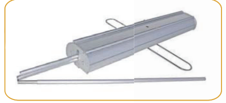
The 3-part bungee-corded pole fits easily into an opening in the aluminum casing for compact storage.