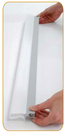
Clipping hanger and kicker