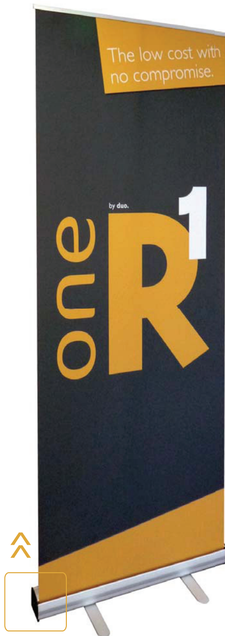
ECl* option for fast and easy graphic installation

The SINGLE-SIDED one.R1 retractable offers the ideal solution, price, and quality for budget-conscious customers. This all-in-one kit includes a light and compact aluminum casing, two retractable feet for perfect stability, and an opening on the back for the bungee-corded pole. The one's dye-sublimation fabric graphics are eco-friendly and durable (no curling) with impeccable colors and finishing! All of these features combined permit a fast and easy set-up in just a few seconds!