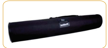
Padded bag with business card pocket