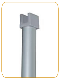
3-part bungee-corded pole