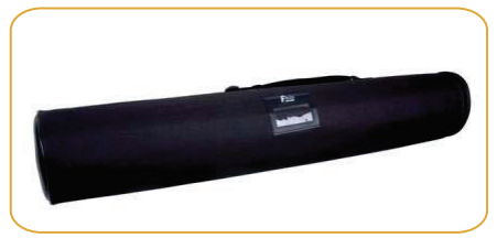
Padded bag with business card pocket