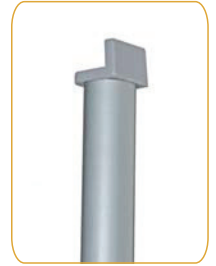
3-part bungee-corded pole